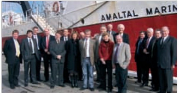
MPs seen here on the wharf at Nelson on the afternoon of the one-day Business Seminar hosted by Talley's Fisheries.