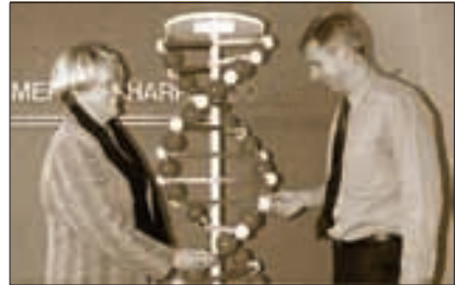
Dianne Yates MP at Merck Sharp and Dohme (NZ) in 2001.