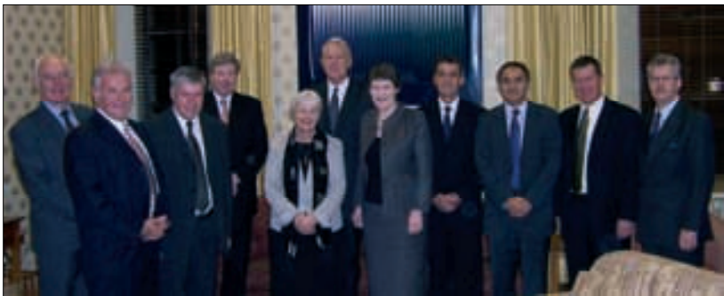
The Prime Minister, Rt Hon Helen Clark, a consistent supporter of the Trust's activities, attended the May President's Dinner hosted by the Speaker of the House and President of the Trust, Hon Margaret Wilson.