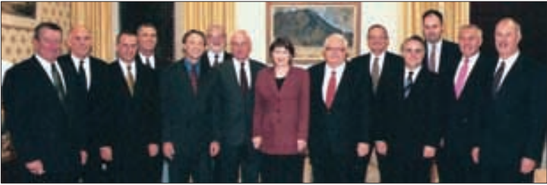
President's Dinner held in March 2000, hosted by the Speaker of the House and President of the Trust, Rt Hon Jonathan Hunt, with special guest, Rt Hon Helen Clark, Prime Minister.

Parliament's 'Father of the House' and newly elected Speaker, Rt Hon Jonathan Hunt, was appointed president of the Trust. Mr Hunt, in his address to the Trust's annual general meeting, said the Trust's work was looked upon as a unique educational resource for all parliamentarians.