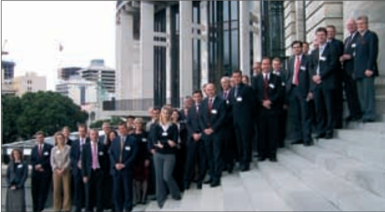
Participants at the May 2006 Parliamentary Seminar standing on the steps of Parliament House.