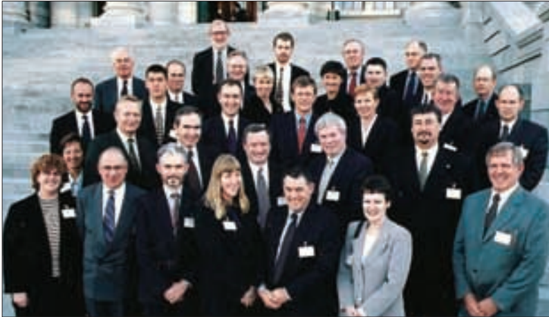
Participants on the steps of Parliament during their attendance at the one-day Parliamentary Seminar in May 2000.