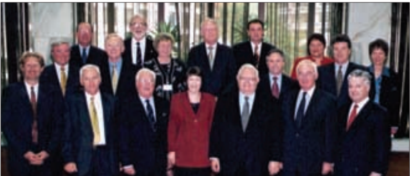
Some of the parliamentary and business Trustees, including founding Trustees, attend a dinner in Parliament in December 1991 to celebrate the Trust's first ten years.