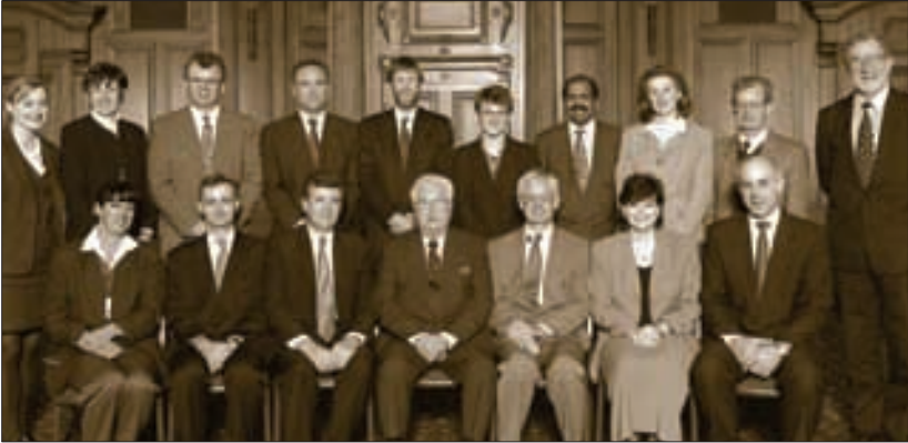
Participants at the first Parliamentary Seminar held in the Legislative Council Chamber in August 1996

For the first time, parliamentary seminars were held in Parliament's Legislative Council Chamber, a larger venue which enabled the Trust to treble the number of participants to 90 a year. This eased the waiting list but the continuing strong demand for places illustrated the popularity of this unique event.