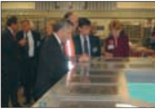
Some of the MPs who visited the mail sorting equipment at Te Puni Mail Centre in Lower Hutt during their day-long visit to New Zealand Post.