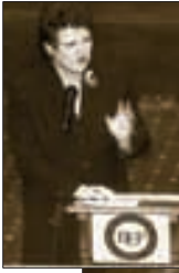
Prime Minister, Jenny Shipley, addressing the Parliamentary Seminar in the Legislative Council Chamber in August 1998.

The parliamentary seminars drew the usual strong response with over 50 business executives attending the two seminars this year.