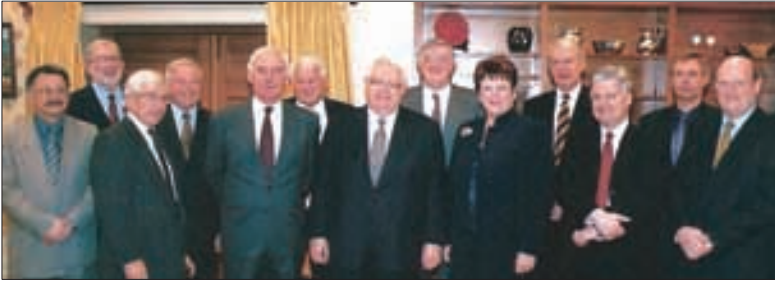
President's Dinner held in August 2000, hosted by Speaker Rt Hon Jonathan Hunt, with special guest the Leader of the Opposition, Rt Hon Jenny Shipley.

The year saw a record number of 91 business people participating in the annual round of parliamentary seminars. In a historic first, the August parliamentary seminar was attended by the Speaker of the Australian House of Representatives, Hon Neil Andrews MP.