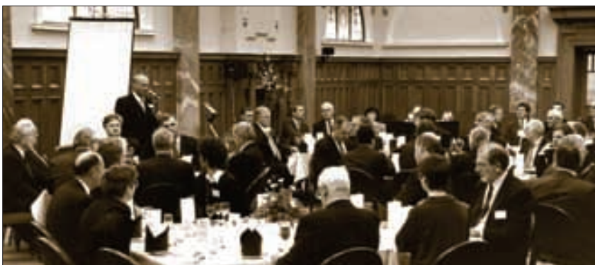
The Trust's President and Speaker of the House, Hon Peter Tapsell, welcomes guests to the first President's Dinner held in Parliament's Grand Hall in August 1996.

This year the Trust introduced the first in a series of President's Dinners. Hon Sir Peter Tapsell hosted corporate members and those closely associated with the Trust to a dinner in Parliament House. The guest speaker, former Prime Minister, Sir Geoffrey Palmer, spoke on the subject of MMP.