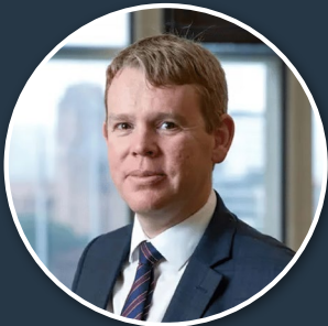
RT HON CHRIS HIPKINS