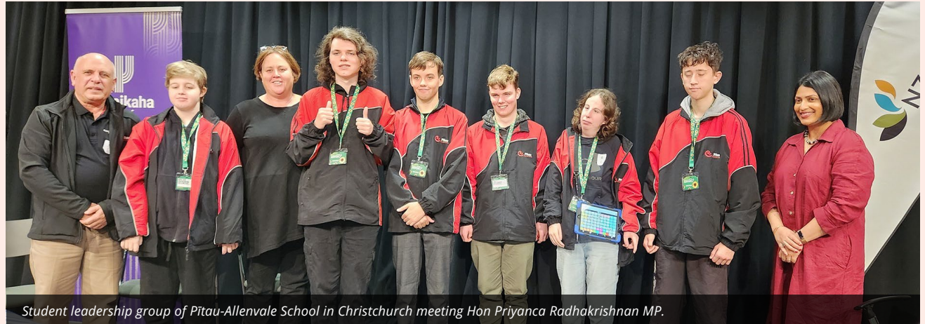
Student leadership group of Pītau-Allenvale School in Christchurch meeting Hon Priyanca Radhakrishnan MP.

The students went to the gifting of the Sign Language name for Whaikaha where they met Hon Priyanca Radhakrishnan MP and later had lunch in the Caucus Room with Sarah Pallett, their local MP.