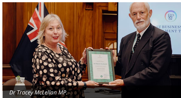
Dr Tracey McLellan MP.

Simon O'Connor MP and Joseph Mooney MP undertook a joint one-day business attachment with New Zealand Post Limited in Auckland and included a site visit to their Auckland processing centre.