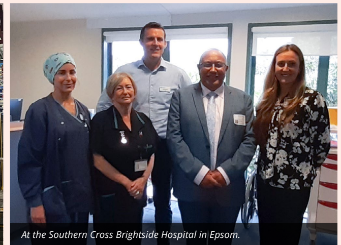
At the Southern Cross Brightside Hospital in Epsom.