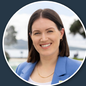
HON BROOK VAN VELDEN MP

Leader of the Opposition (from 27 November 2023)