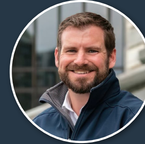
TIM VAN DE MOLEN MP

Member for Tukituki, Labour Party Representative (to October 2023)